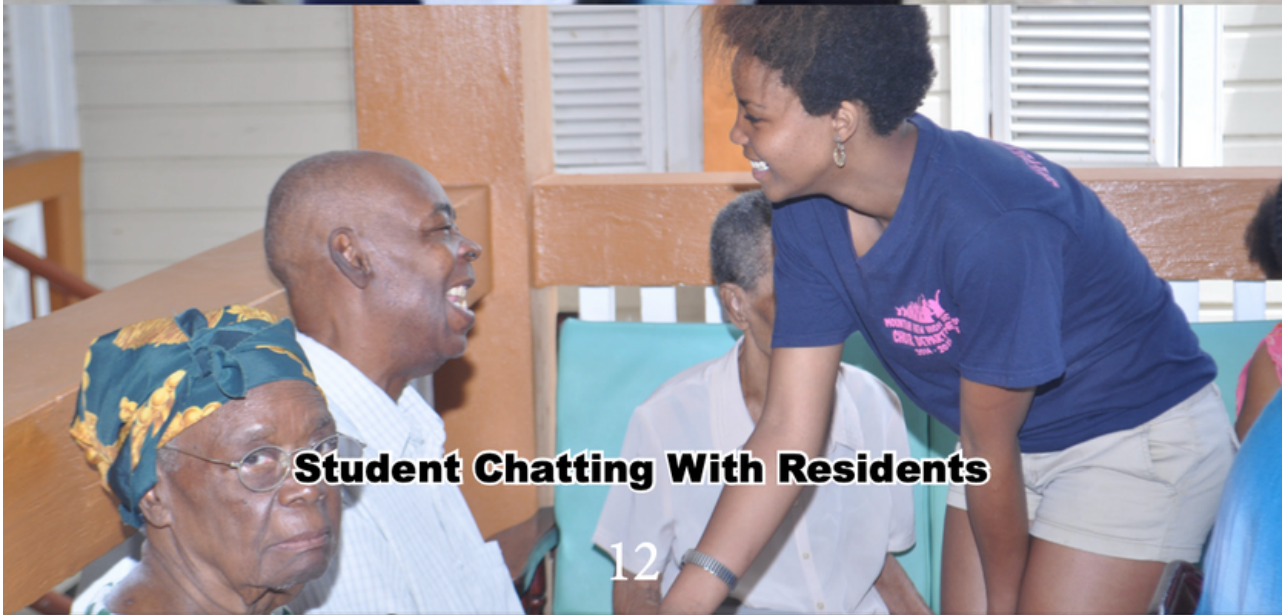
Student Chatting With Residents