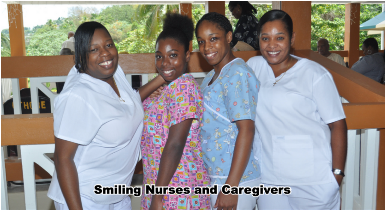
Smiling Nurses and Caregivers