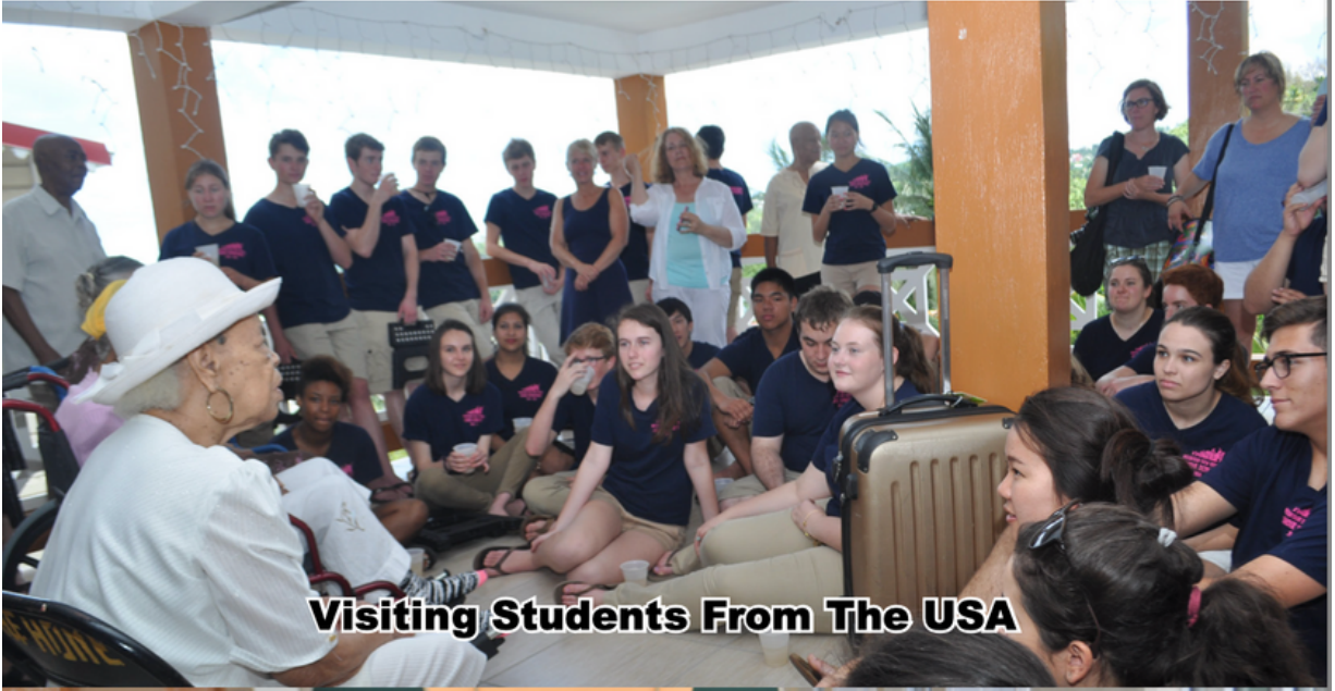
Visiting Students From The USA