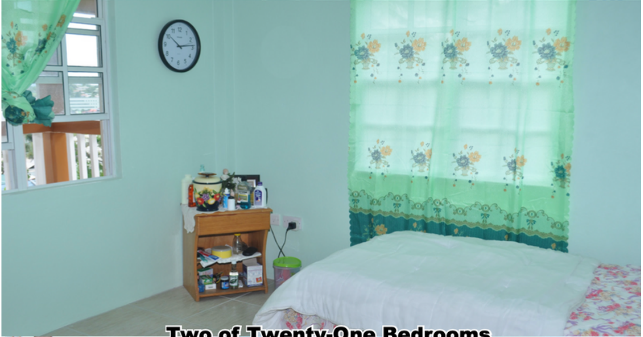
Two of Twenty-One Bedrooms