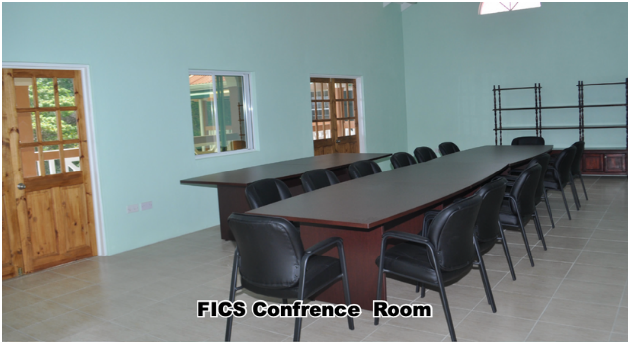
FICS Conference Room