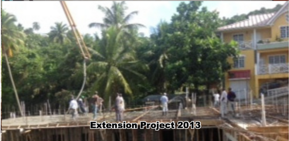
Extension Project 2013