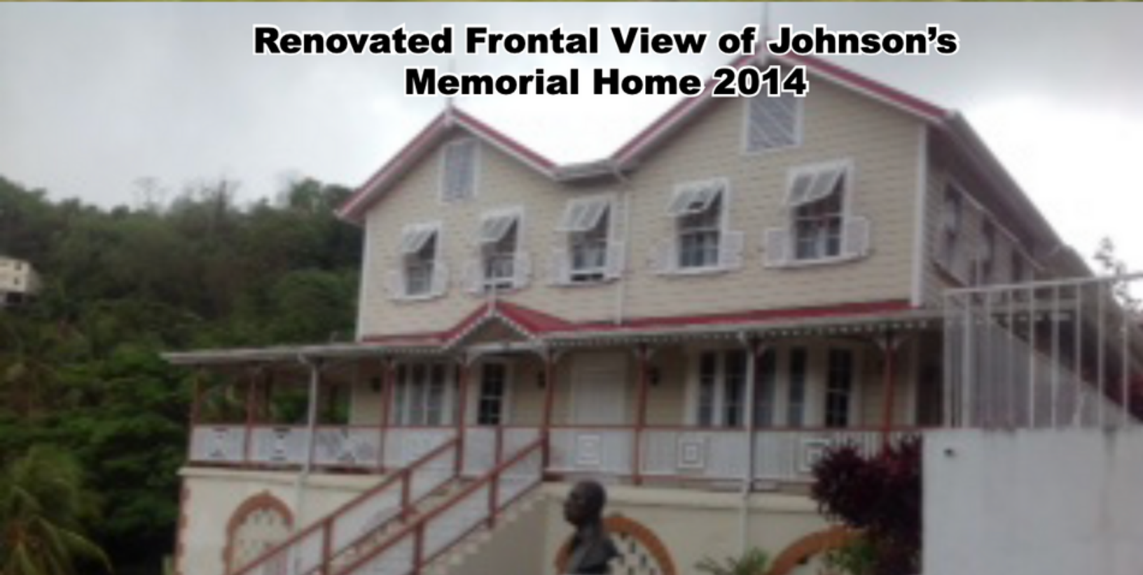
Renovated Frontal View of Johnson's Memorial Home 2014