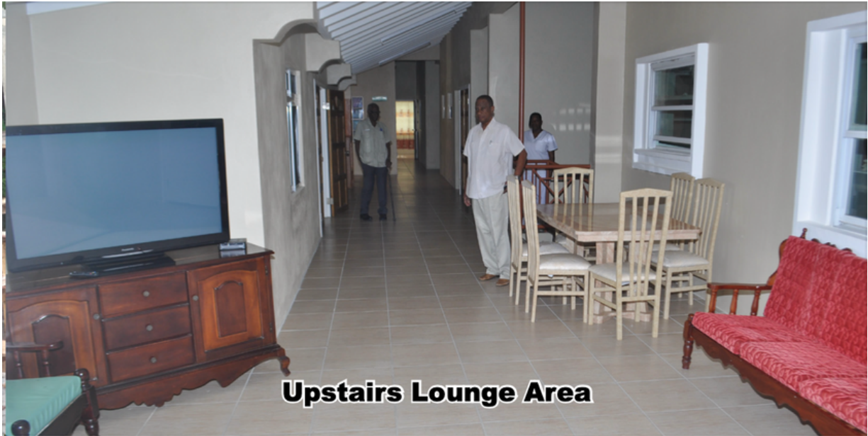
Upstairs Lounge Area