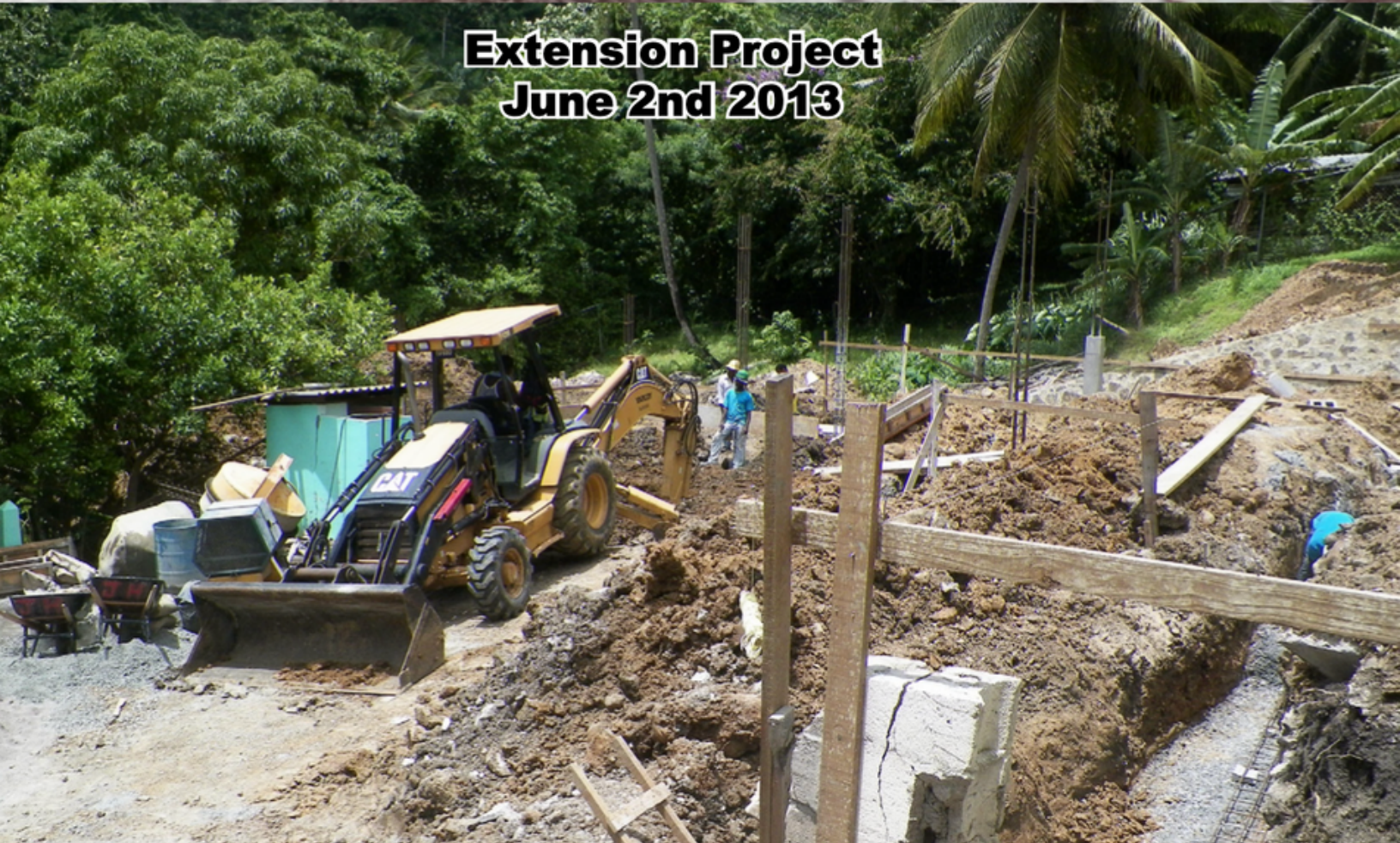
Extension Project June 2nd 2013