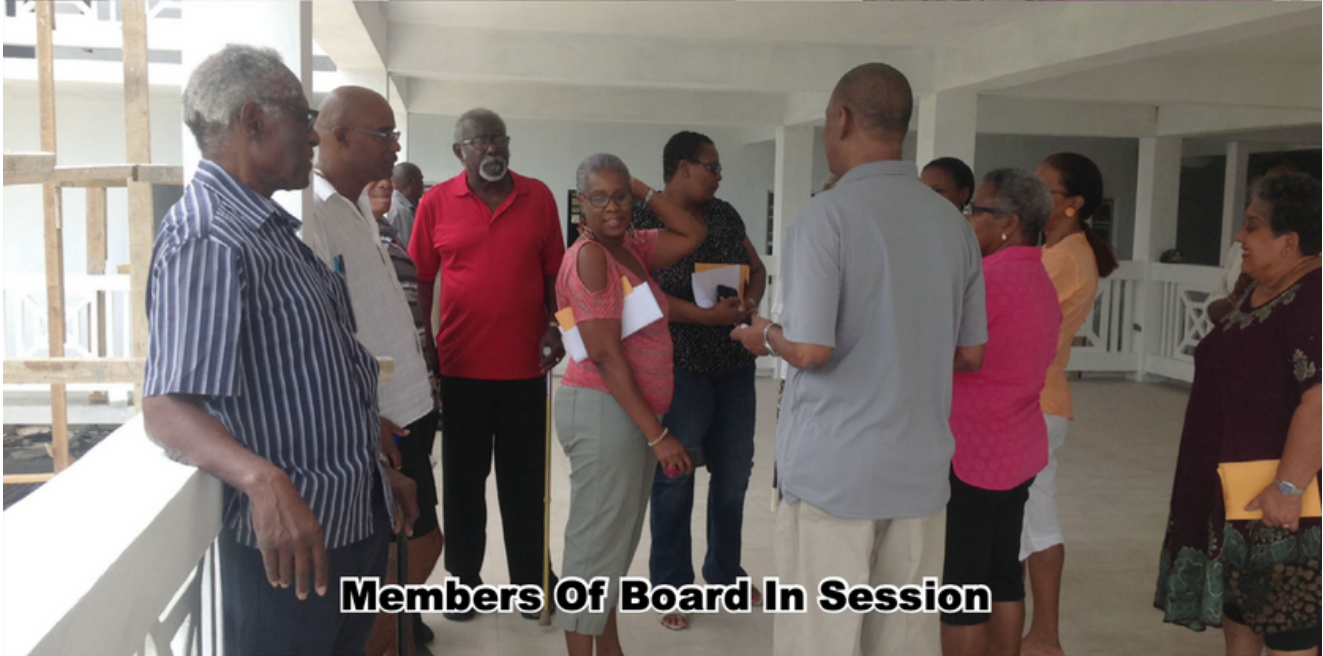
Members Of Board In Session