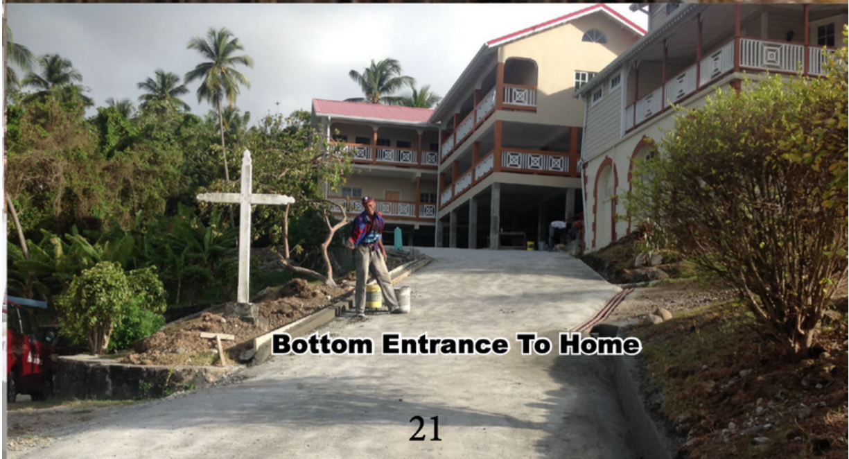
Bottom Entrance To Home