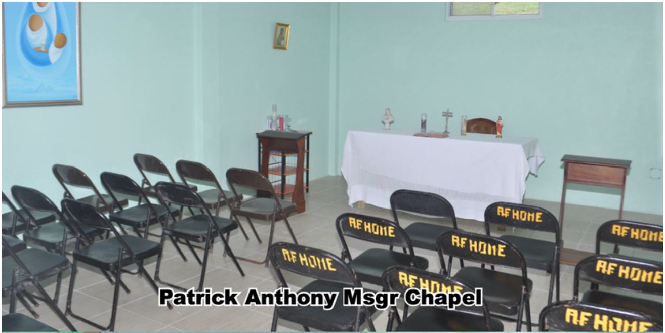
Patrick Anthony Msgr Chapel