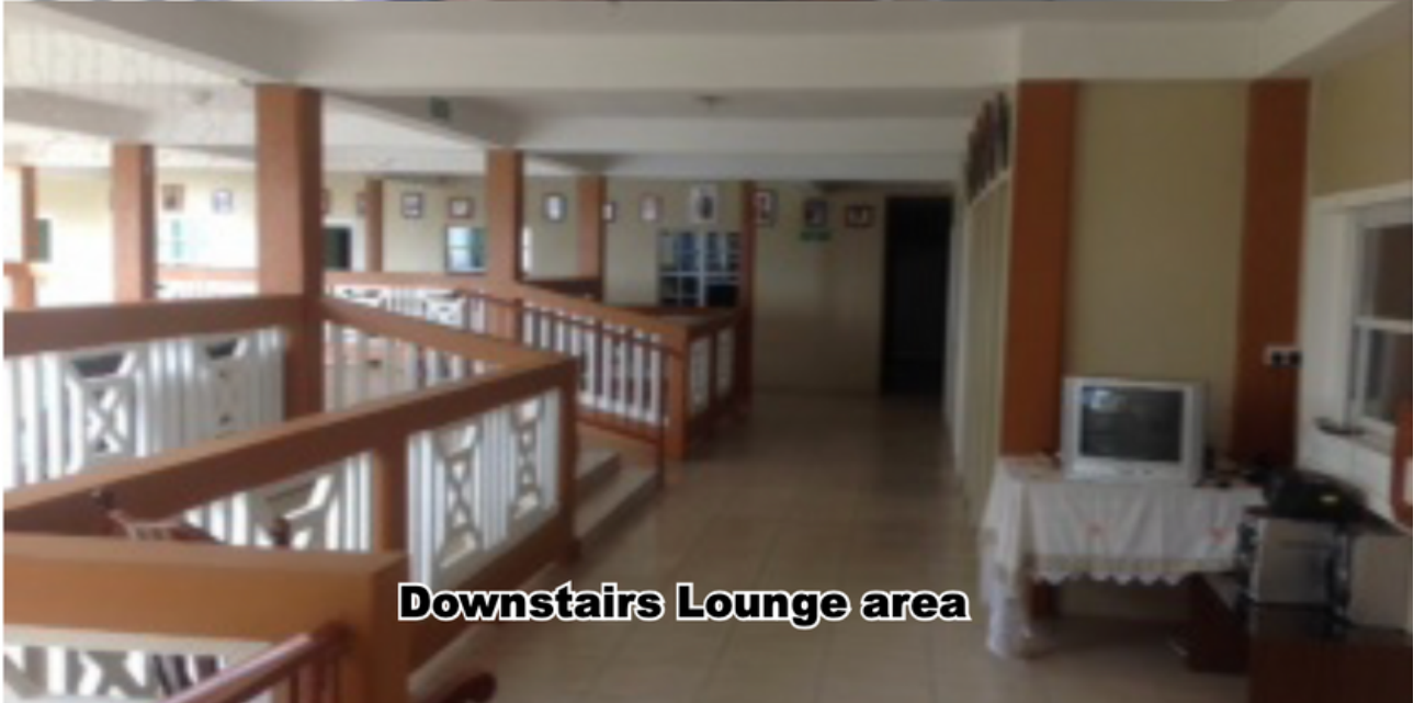
Downstairs Lounge area