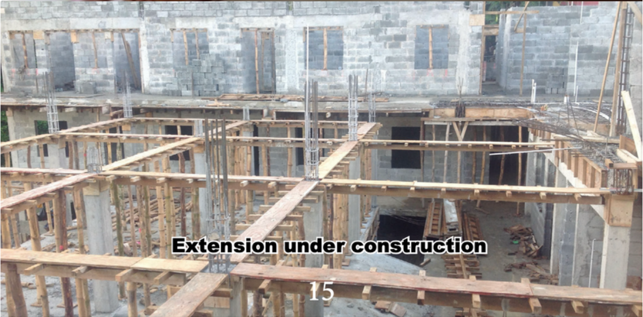
Extension under construction