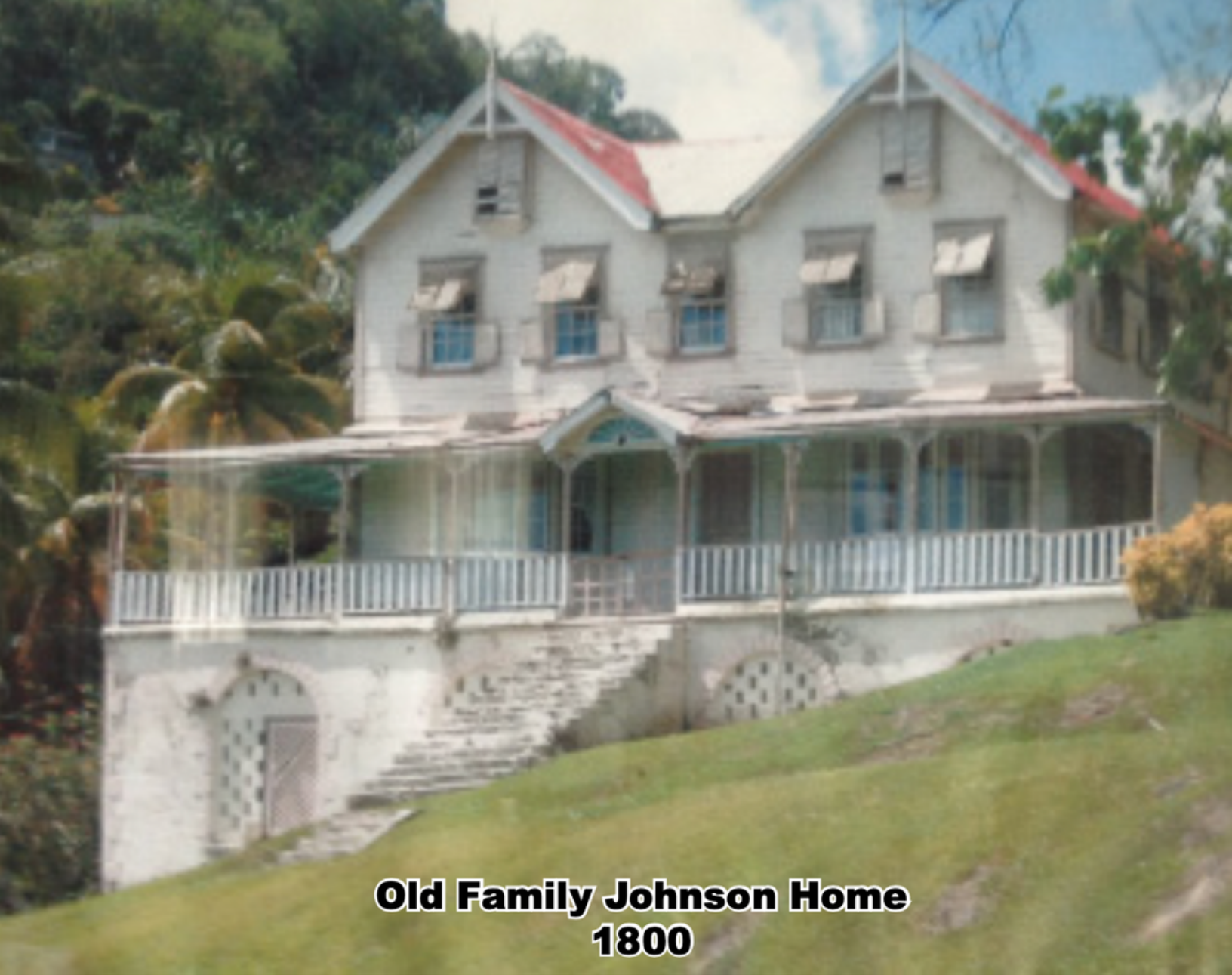
Old Family Johnson Home 1800