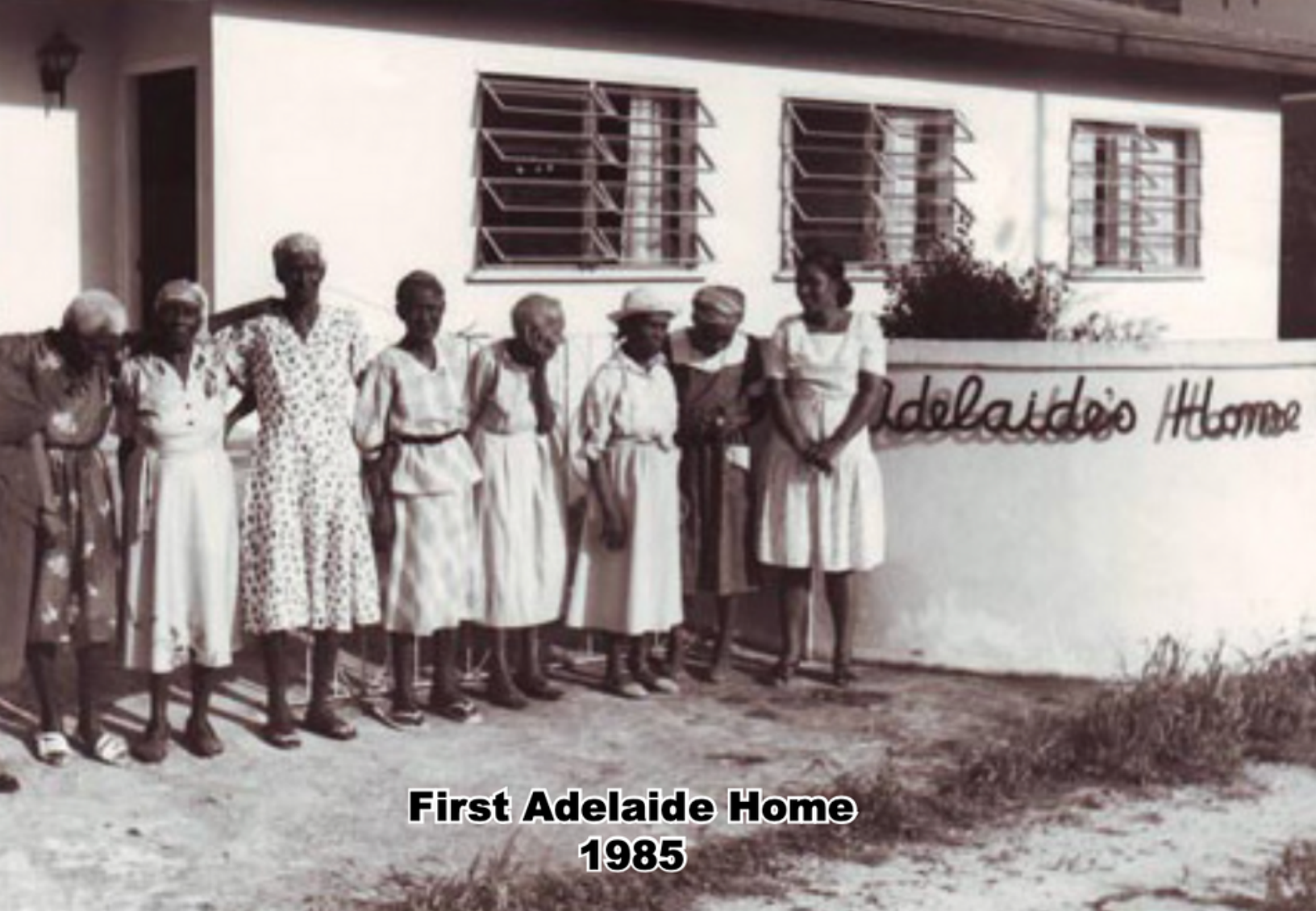
First Adelaide Home 1985